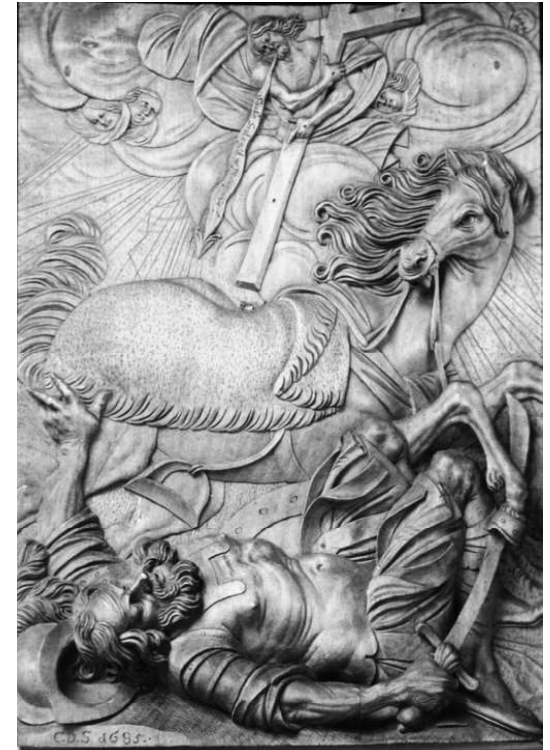
St. John United Church of Christ 301 S. Market Street New Athens, Illinois 62264